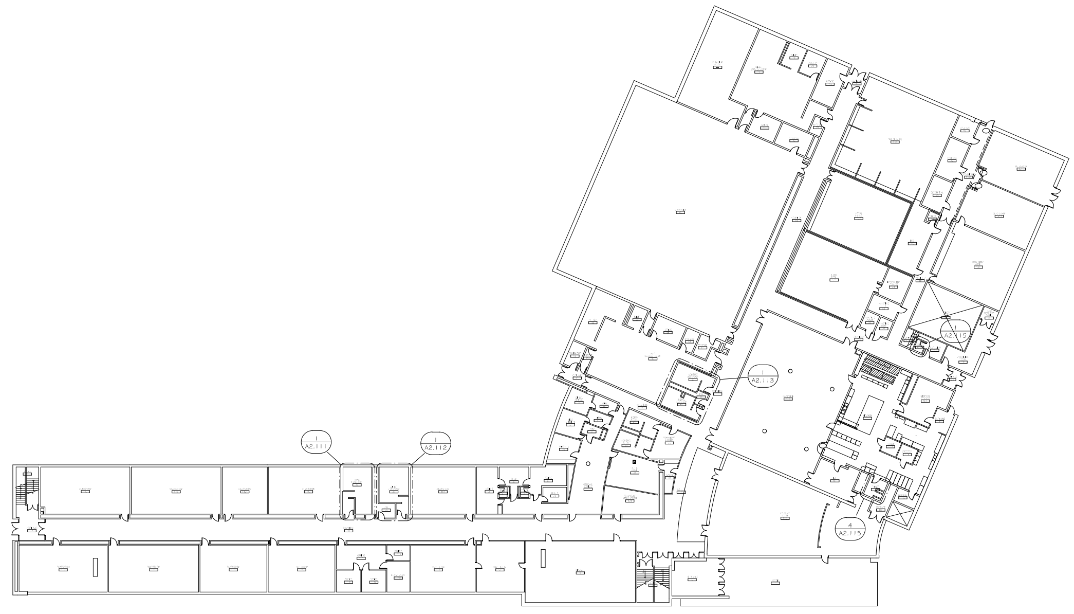
1 FIRST FLOOR PLAN 3/64" = 1'-0" N↑